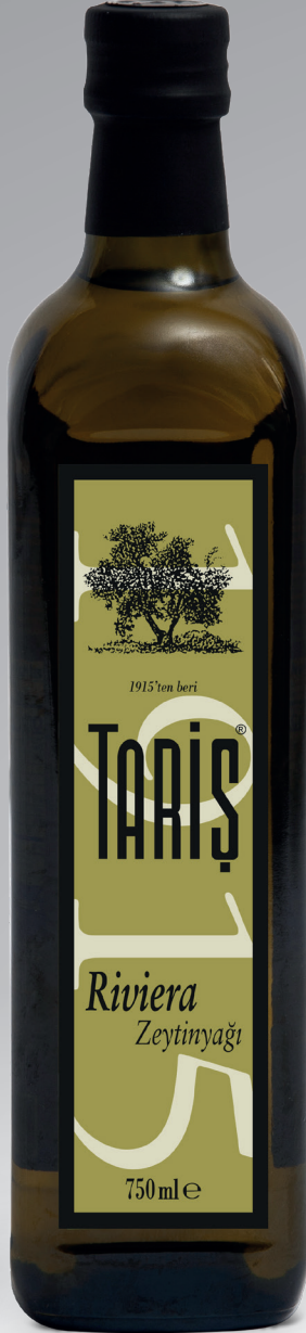
OLIVE OIL 750 ml / Marasca