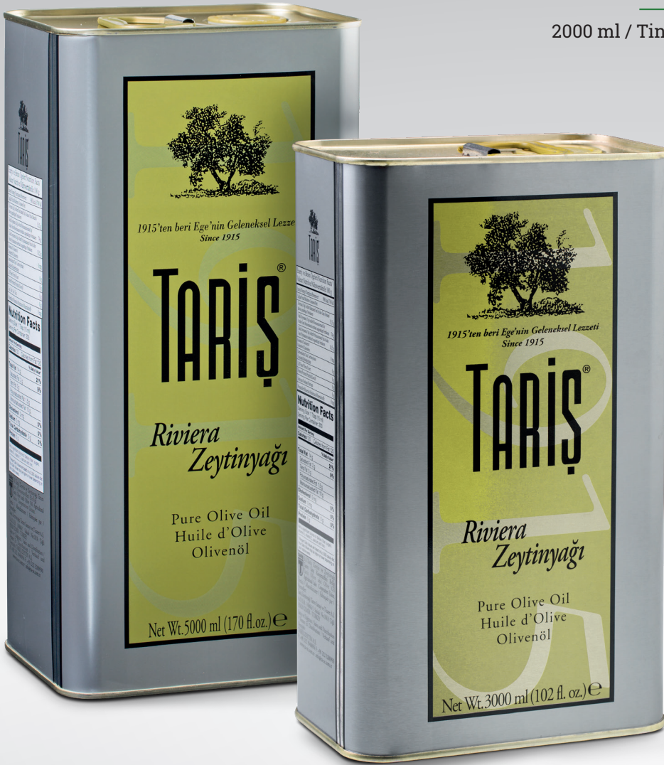
OLIVE OIL 5000 ml / Tin