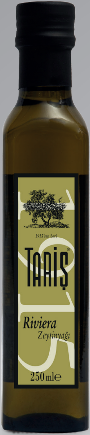
OLIVE OIL 250 ml / Marasca