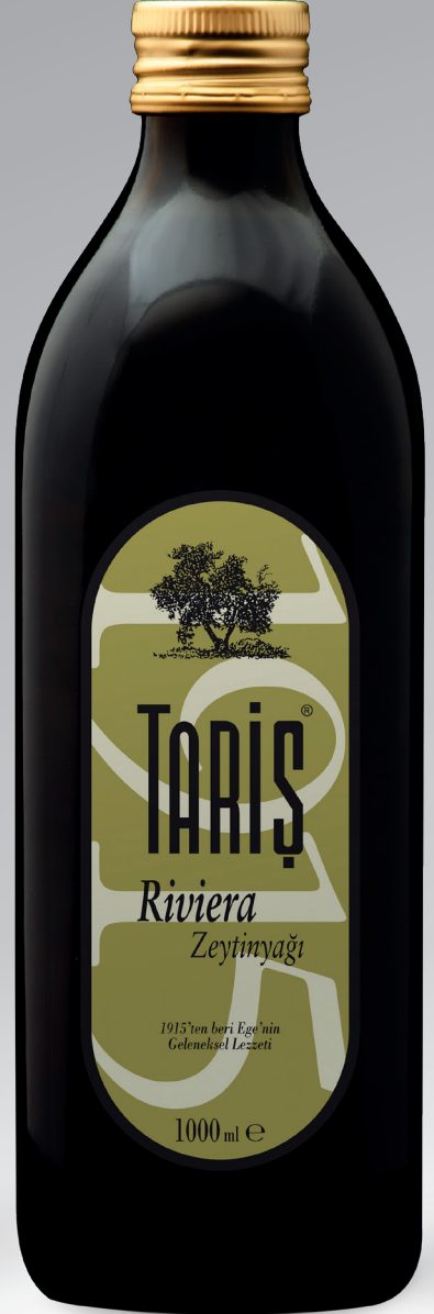
OLIVE OIL 1000 ml / Standard