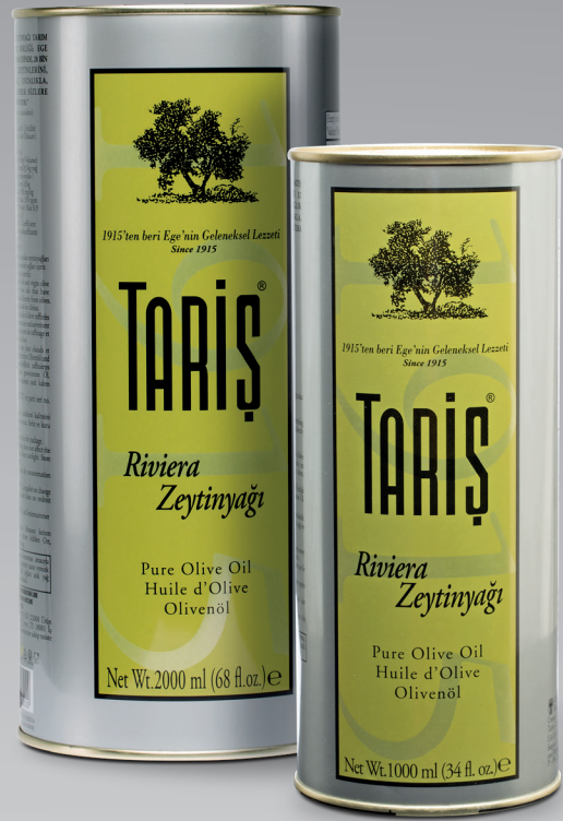
OLIVE OIL 2000 ml / Tin