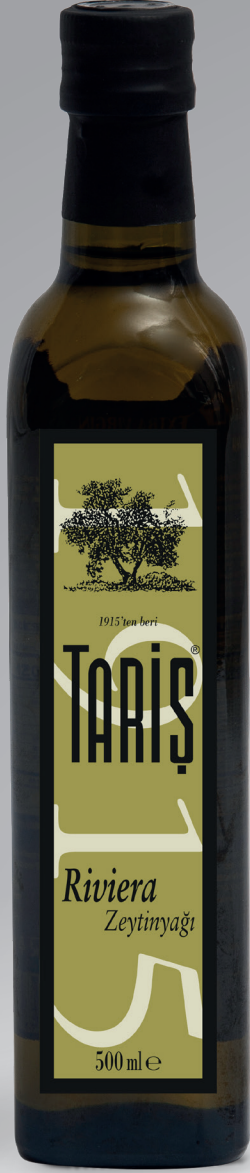
OLIVE OIL 500 ml / Marasca